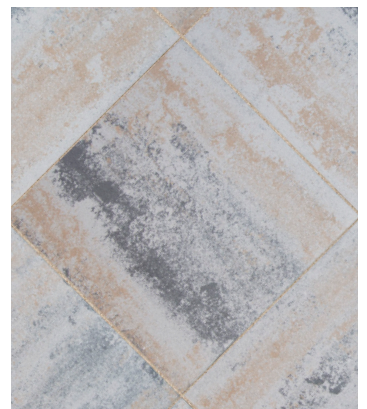
BODEGA DUNES SMOOTH