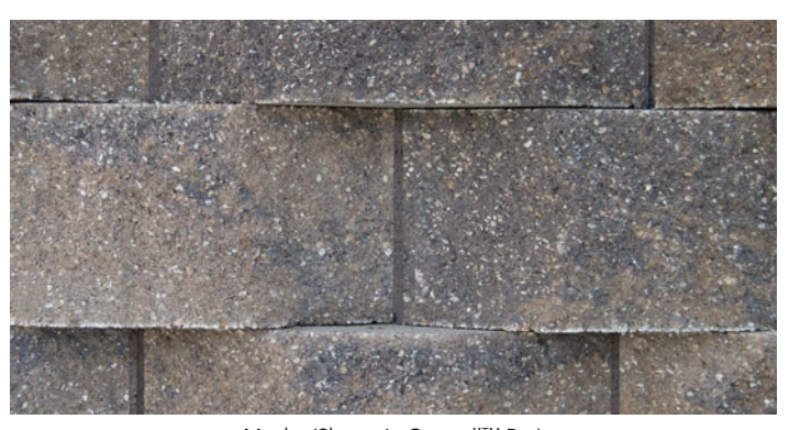
Mocha (Shown in Geowall™ Pro)