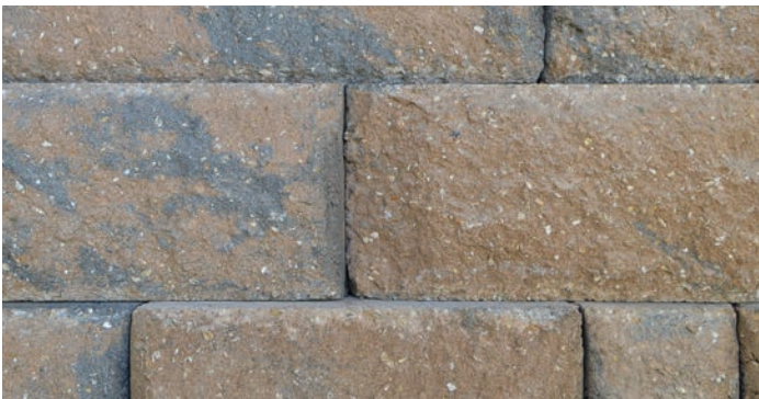
Carmel (Shown in Bayfield ® )