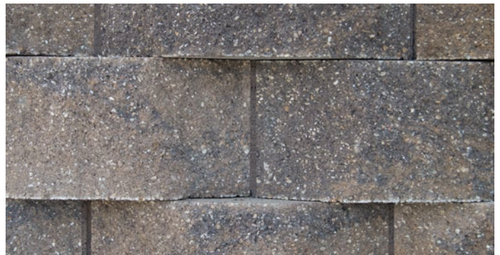
Mocha (Shown in Geowall ™ Pro)