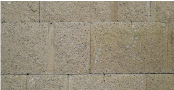
Tan (Special Order)