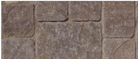
Verona (special order)