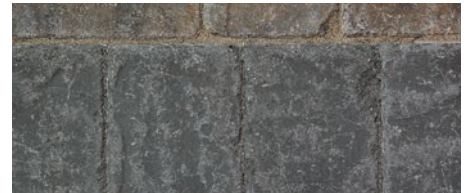
Charcoal 6x9 Border