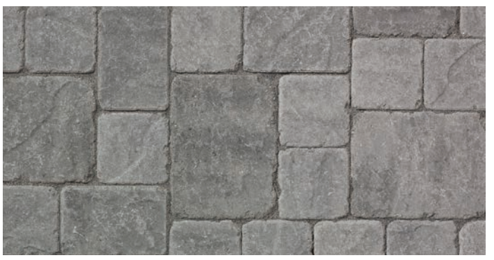
Pacifica (Special Order)