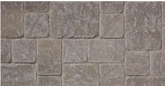
Venice (Special Order)