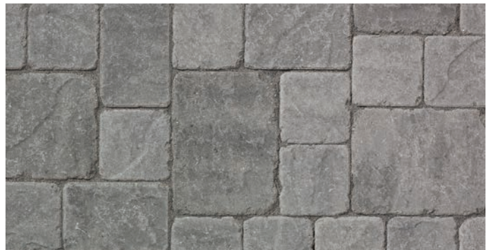
Pacifica (Special Order)