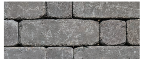
Bluestone (Special Order)