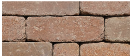
Desert (Special Order)