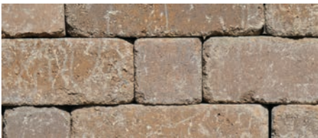
Santa Fe (Special Order)