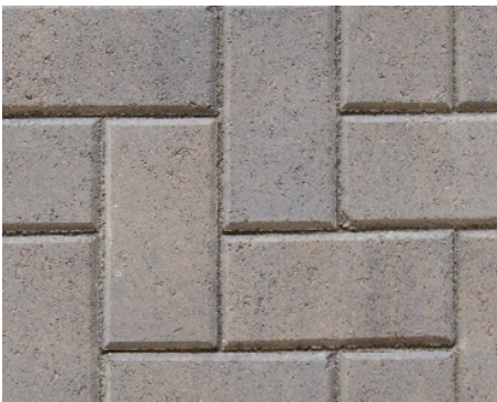
Venice (Special Order)