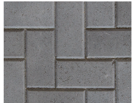
Lamp Black (Special Order)