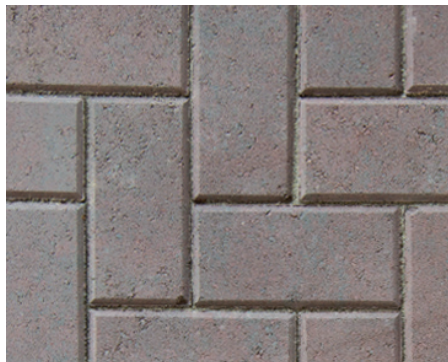
Mendocino (Special Order)