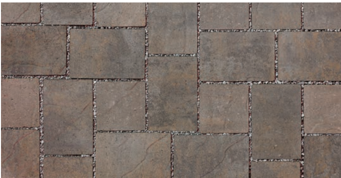
Positano (Special Order)