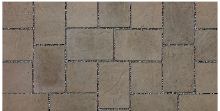
Verona (Special Order)