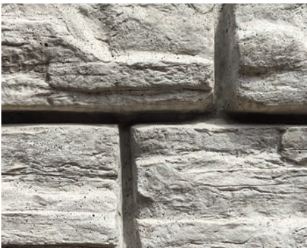
GREY ROCK (WEATHERED EDGE)