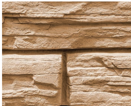
SANDSTONE (WEATHERED EDGE)