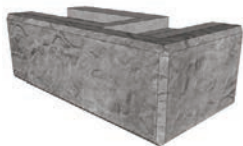
Reversible Corner Block