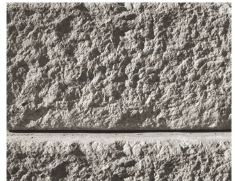
NORTH SHORE GRANITE (SPECIAL ORDER TEXTURE)

Additional color options can be provided with post applied staining. Stains are readily available and easily applied in the field to achieve a natural look that will last for years.