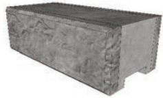
Full High Cap