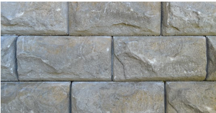
Flint (Special Order)