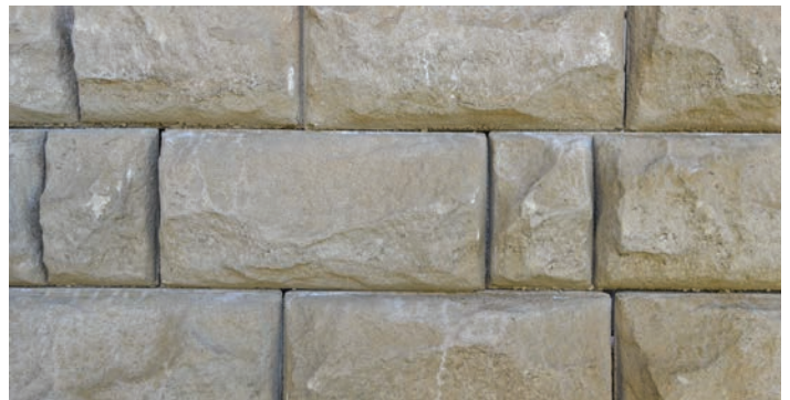
Sandstone (Special Order)