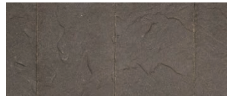
RIFLE 6X9 BORDER