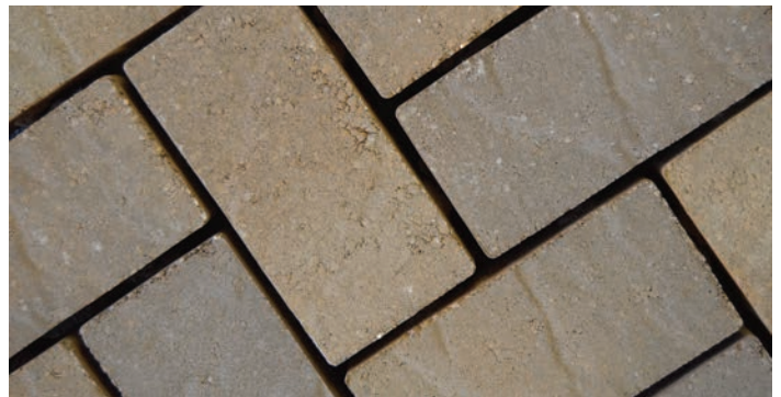
Venice (Smooth or Textured - Special Order)