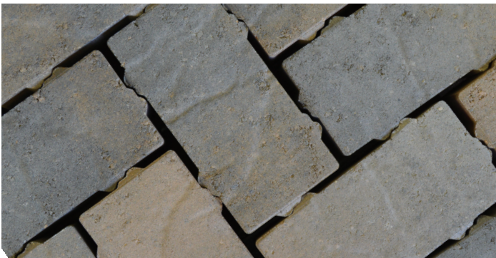
Positano (Smooth or Textured - Special Order)