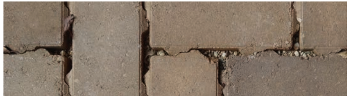
Venice (Smooth - Special Order or Textured-Stock)