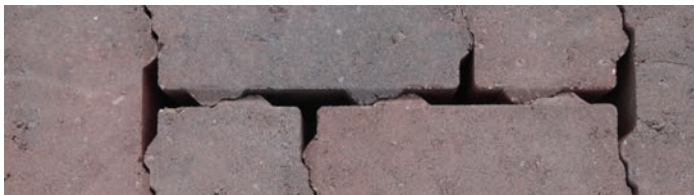
Mendocino (Smooth or Textured - Special Order)