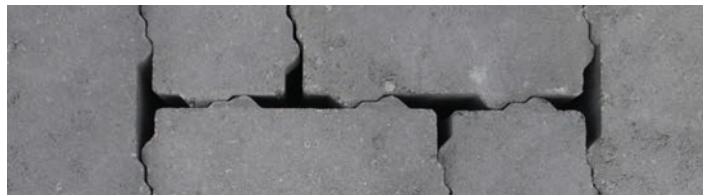
Lamp Black (Smooth or Textured - Special Order)