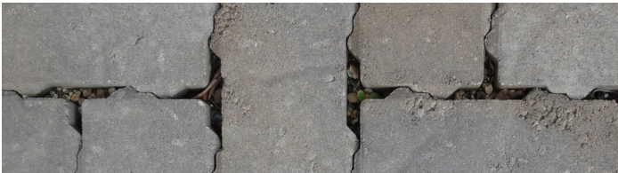
Positano (Smooth - Special Order or Textured-Stock)