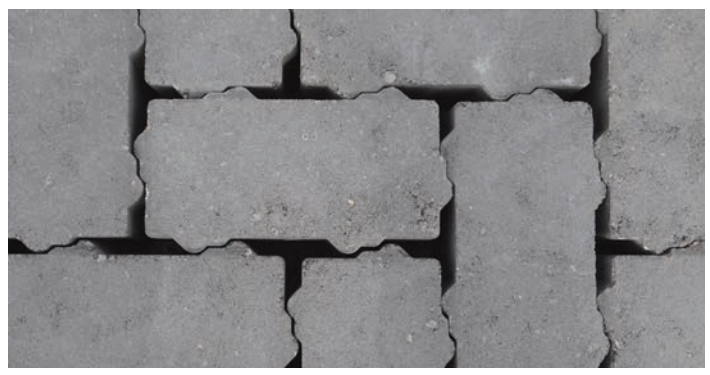
Natural (Special Order) Smooth Finish