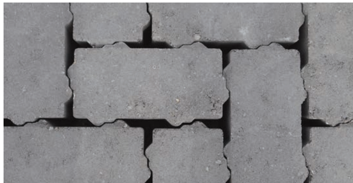
Natural (Special Order) Smooth Finish