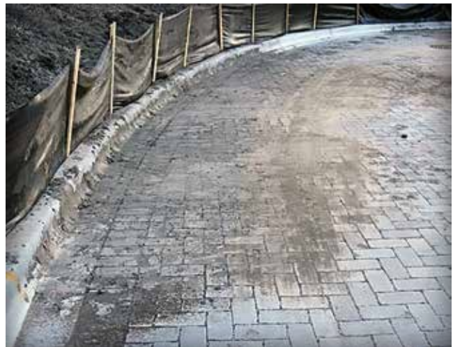
Figure 3. Whether eroded onto or dumped on PICP, erosion and sediment control are essential during construction.

Maintain filled joints with stones. The jointing stones capture sediment at the surface so it can easily be removed. If sediment is allowed to settle and consolidate, then cleaning becomes more difficult since the sediment is inside the joint rather than on the surface. Settlement of