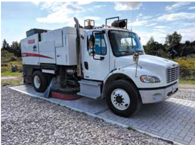
Figure 20. This type of mechanical sweeper removes sediment from joints parallel to the direction of the broom rotation.

Street Sweepers —These typically have rotating plastic bristle brushes positioned near the curb side and center pickup into a hopper at the rear. Do not use water as it slows removal of loose dirt into the machine. This machine does provide a small vacuum force to manage dust, but the cleaning action is provided by the mechanical sweeping, so it is moderately effective among large machines