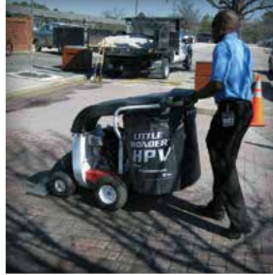
Figure 18. Walk-behind vacuum cleans a small parking area.