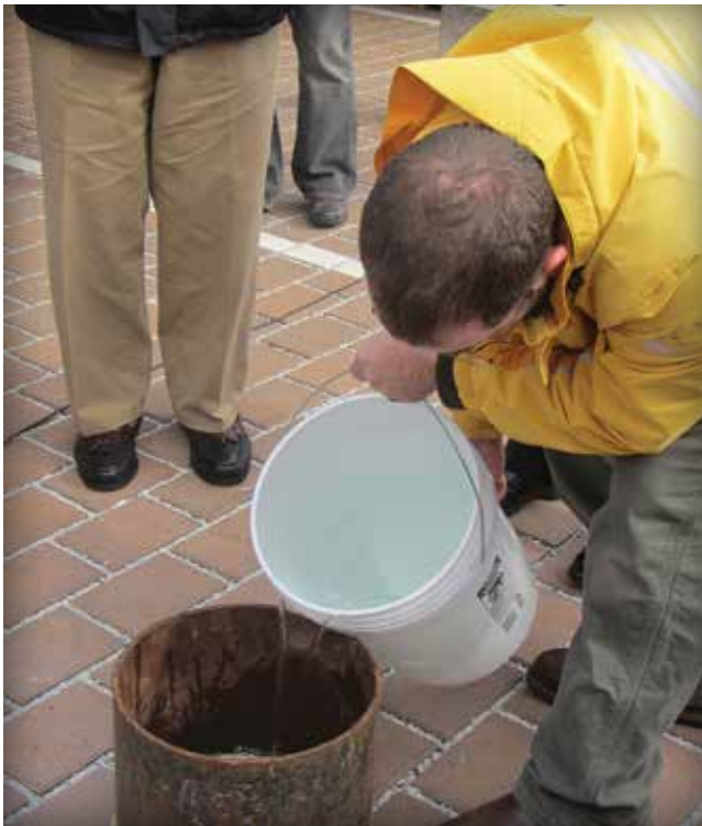
Figure 13. ASTM C1781: pouring the water into a 12 in. (300 mm) inside diameter ring set on plumber's putty.

ASTM C1781 test method begins with “pre-wetting” an area inside the ring to ensure the surface and materials beneath are wet. This is done by slowly pouring 8 lbs (3.6 kg) of water while not allowing the head of water on the paver surface to exceed \frac{3}{8} in. (10 mm) depth. If the time to infiltrate 8 lbs of water is less than 30 seconds (using a stopwatch typically on a cell phone), the subsequent test is done using 40 lbs (18 kg) of water. If more than 30 seconds, then 8 lbs of water is used in the subsequent tests. Again, a \frac{3}{8} in. (10 mm) head is maintained during the pour while being timed with a stopwatch. The surface infiltration rate is calculated using formulas in the test method.