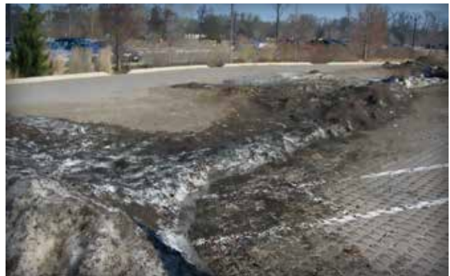
Figure 26. This is an example of snow that should have been deposited on a grassy area. If such areas are not available, then vacuum clean the PICP in the early spring.

Snow Removal —Unlike other permeable pavement surfaces, PICP demonstrates durability in the winter. PICP can be plowed with steel or hard rubber blades. Steel blades typically scratch all pavement surfaces. When using commercial snow removal companies, confirm in writing they provide protective edges on the snowplow equipment to avoid scratching the surface. Most pavers have chamfers on their surface edges which can help protect the edges from chipping by snow plows. For smaller areas, use a plastic snow shovel and fit snow blowers with plastic on the scoops and on the gliders. When possible deposit plowed snow onto grassy areas and not on the PICP when the plowed snow is dirty. Such dirt will remain and likely help clog the PICP surface after the snow melts.