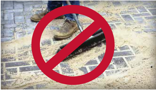
Figure 2. Sand-filled joints and bedding common to interlocking concrete pavement are not used in PICP.

Every PICP site varies in sediment deposition onto its surface, particle size distribution, and the resulting cleaning frequency. For example, beach sand (a coarse particle size distribution) on the surface will not clog as quickly and require less effort removing than fine clay sediment. Besides the particle size distribution, the rate of surface infiltration decline also depends on the traffic, size, and slope of a contributing impervious area, adjacent vegetation and eroding soil, paver joint widths and jointing stone sizes. ICPI offers a PICP site selection tool on www.icpi.org/resource-library/software-programs to help identify favorable sites and avoid one that may incur additional maintenance.