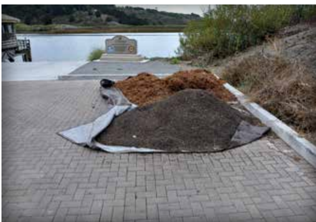
Figure 5. Mulch placed on tarps prevents more expensive cleaning of PICP.

Manage mulch, topsoil and winter sand. Finally, stockpiling mulch or topsoil on tarps or on other surfaces during site maintenance activities rather than directly on the PICP