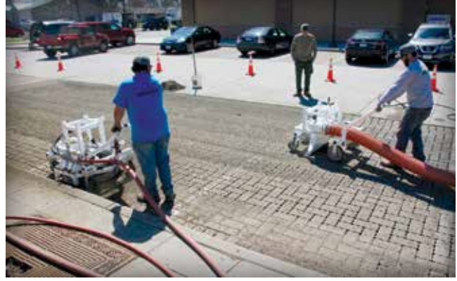
Figure 24. This equipment blows sediment and soiled aggregate from the joints and uses vacuum equipment to remove them.