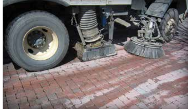
Figure 21. A regenerative air machine does routine cleaning in a PICP parking lot.