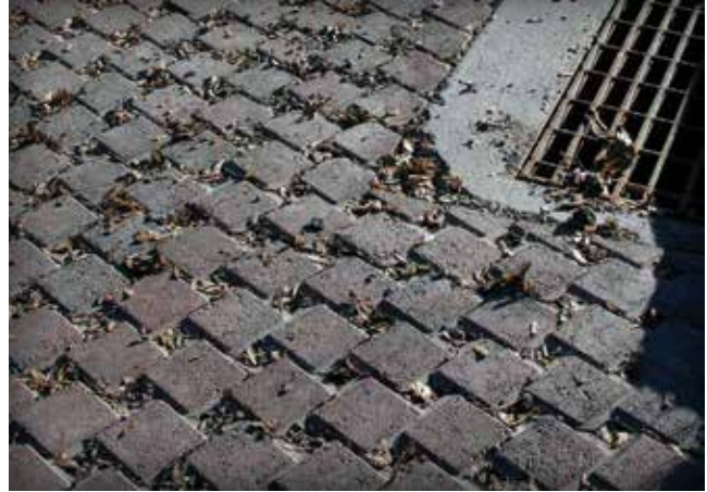
Figures 7 and 8. Pine needles and leaves eventually will degrade and get compacted into the joints from traffic. They should be removed by sweeping or vacuuming before that happens.

surface helps maintain infiltration. Figure 5 illustrates an example of correct management of landscaping material on PICP, as well as the need to exposed soil slopes.