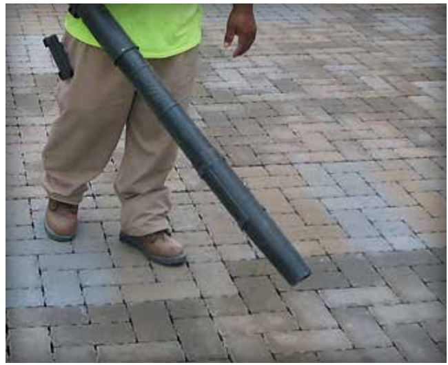
Figure 15. Blowing debris to curbs or gutters for removal and disposal.