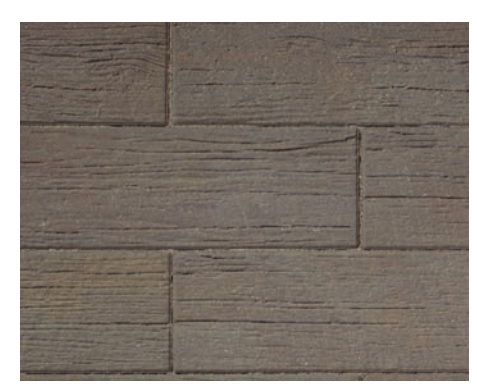
Teakwood (Special Order)