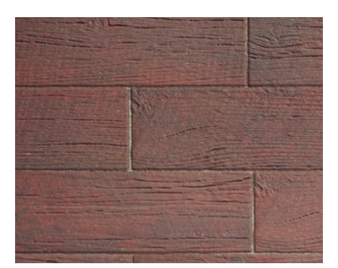
Redwood (Special Order)