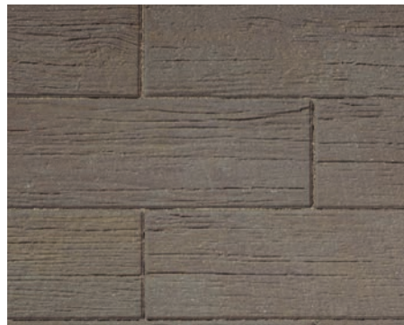
Teakwood (Special Order)