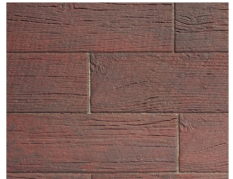
Redwood (Special Order)