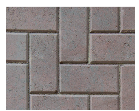
Mendocino (Special Order)