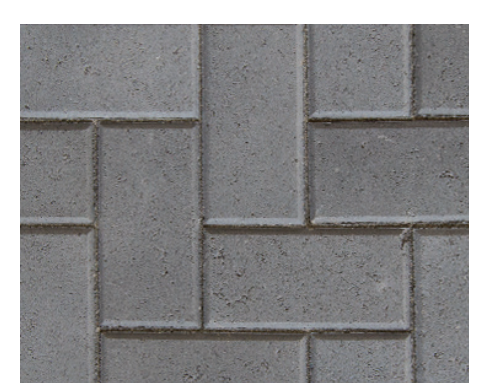
Lamp Black (Special Order)